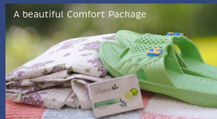
A beautiful Comfort Package